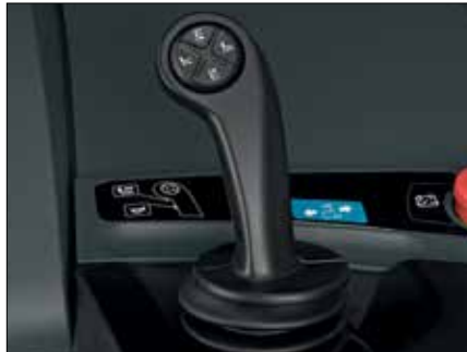
Multifunction control handle