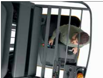
Overhead guard visibility