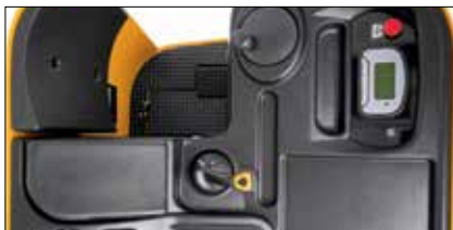
Productivity through ergonomics